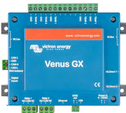
Venus GX with connectors