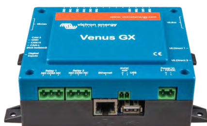
Venus GX front angle